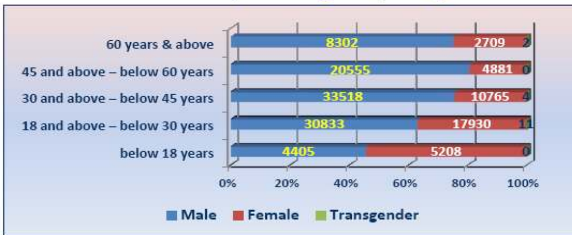
Suicide Victims by Sex and Age Group during 2019